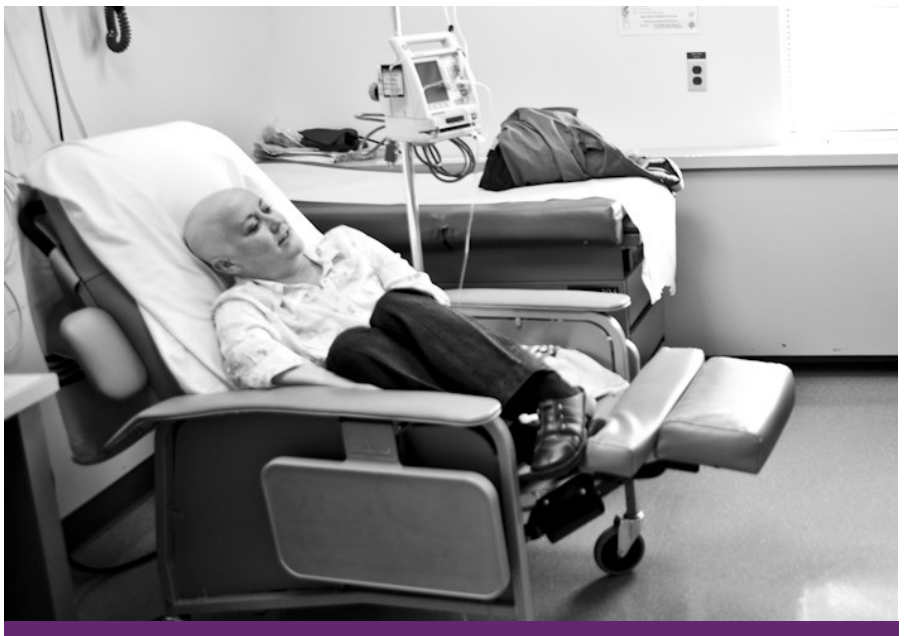
Each day, more than 150 patients are treated in the Cape Breton Cancer Centre.