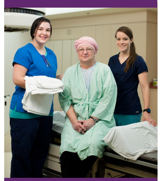
Finances should be the least of their worries in the sickest of their days.

With 1,951 new diagnoses in 2017, cancer care is needed more than ever. Many patients struggle financially when diagnosed, this fund let's them focus on their health instead.